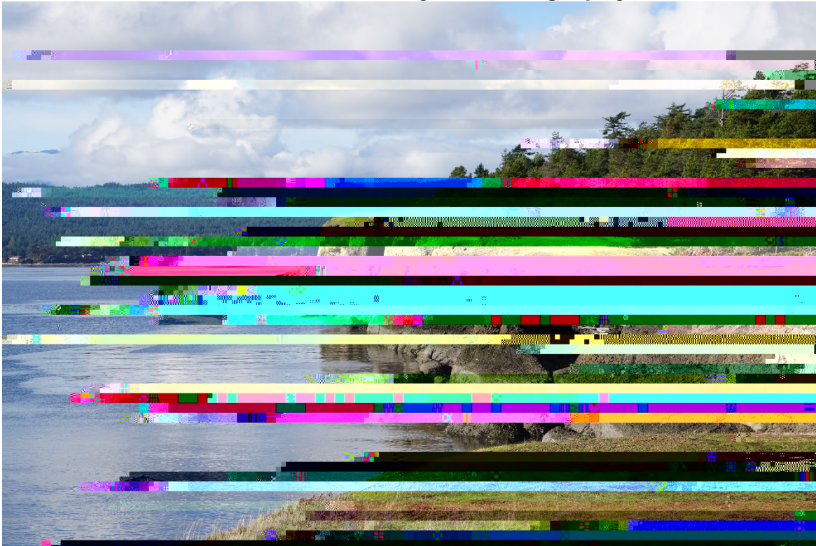
Coastal bluffs in Helliwell Provincial Park, Hornby Island