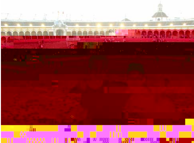
At the bullfight

Passing through Lisbon brought us to the Algarve. We arrived in Lagos, a small fishing village known by many travellers for its gorgeous coastline, relaxed atmosphere, and exciting social life. We stayed in a cozy hostel minutes from the beach that boasted a large central courtyard which promoted story sharing and other fun conversation among its residents. After the fast paced driving of the previous days, we easily warmed up to the idea of relaxing on the beach. We stayed there for the next five days. We could fill volumes with our great experiences in Lagos, it was the highlight of our trip.