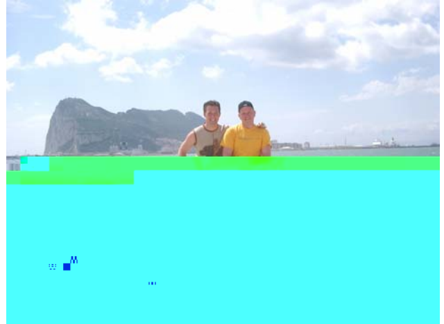
The Rock of Gibraltar

The 36-degree temperatures only added to the cultural experience before heading east to Marbella. It was here on the Costa del Sol that we soaked up the last of the Spanish sunshine between quick visits to Gibraltar, Algeciras, Granada, and Alicante before finishing our trip with a marathon 900 km drive back to Barcelona.